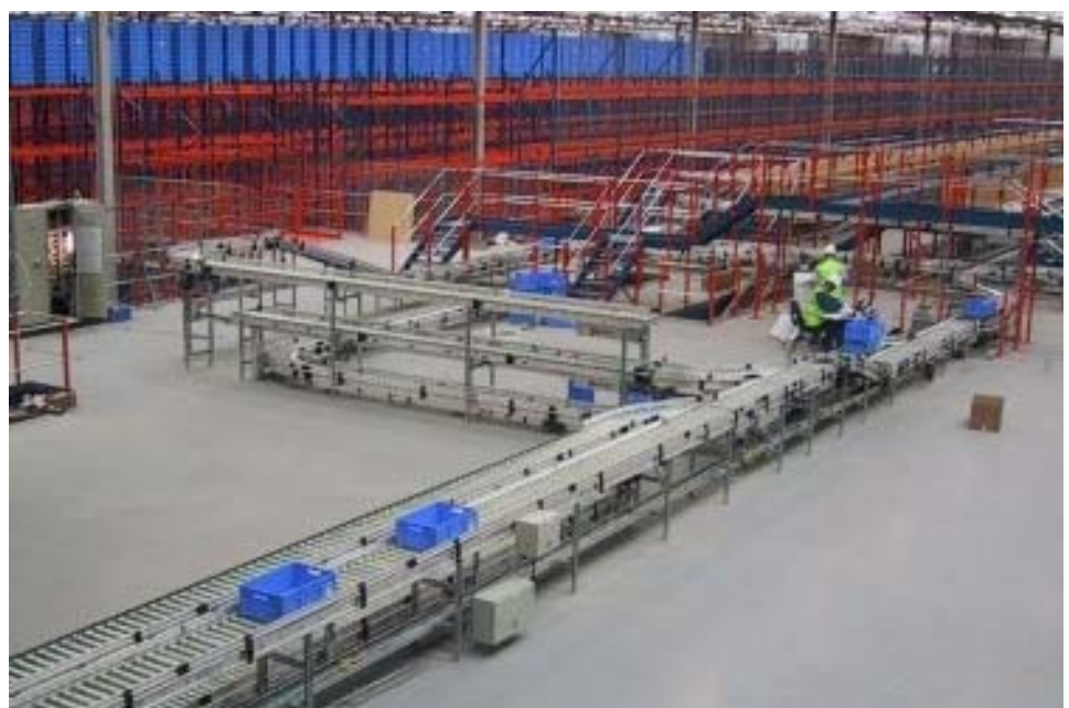
Figure 2. Kingfield Heath chooses an experienced WMS vendor.

We have seen many drop outs and newcomers in the Benelux in the past six years. The WMS market